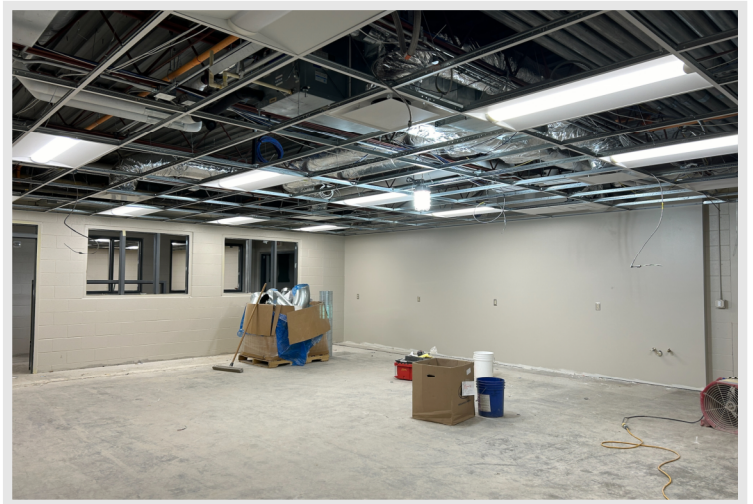
Ceiling grid/borders in place with newly installed overhead MEP fixtures in the Ag Classroom. Finishes are looking sharp!