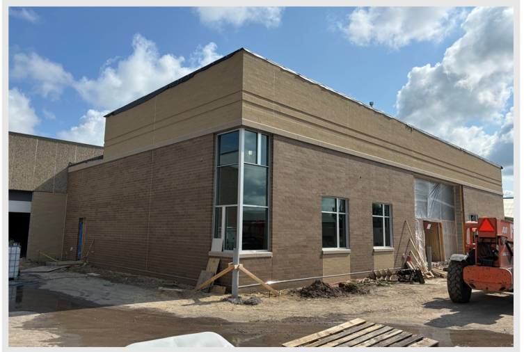
Masonry veneer is complete, and aluminum storefronts have been installed in the Skills Lab Addition!

Finishing up the month of July, the Jefferson High School project continues to take shape! Following the completion of masonry veneer work, new glass storefronts were installed at the Skills Lab Addition. Also at the Skills Lab Addition, new bollards, stoops, and the central apron are being poured in place. In other areas of the project, ceiling grid and borders are nearing completion in all the classroom spaces, while overhead painting progresses through the Head House and Shop areas. Finally, MEPFP (Mechanical, Electrical, Plumbing, Fire Protection) crews are installing new fixtures and devices, including a few neat additions like the new kitchen hood, backshelf exhaust hoods, and trench drains in the Auto and Ag Shops. Exciting things are coming here at the High School, stay tuned!