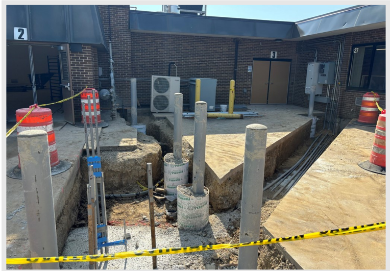
Excavation is complete and the bollards are set for the new generator!