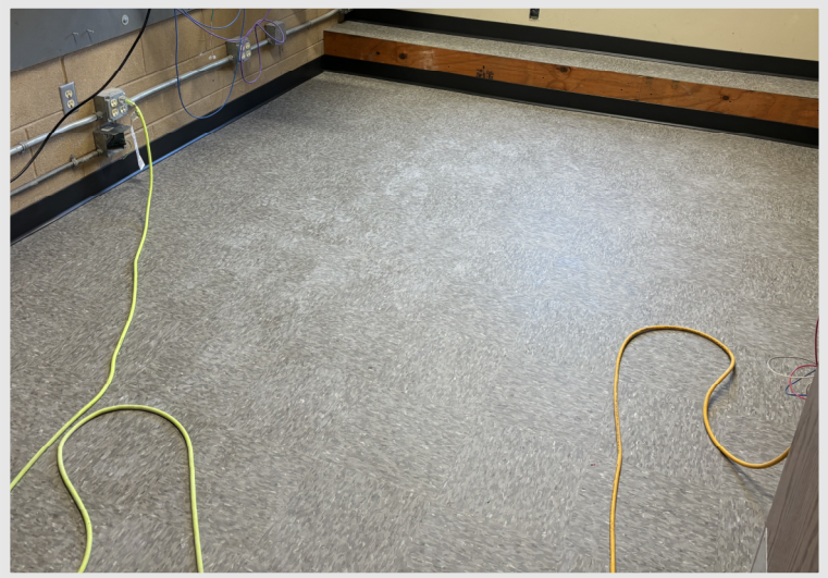
New flooring in the Data Room.