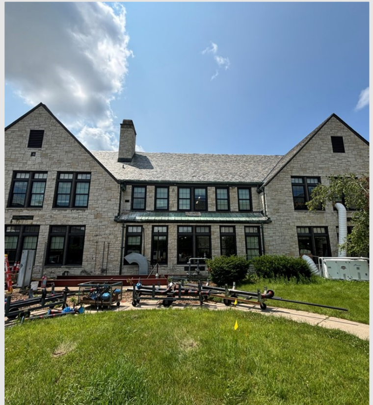
The new windows are looking great!