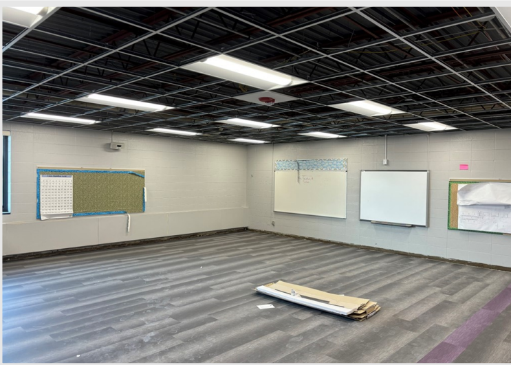
Flooring, ceiling grid, and ceiling border installed in a classroom.