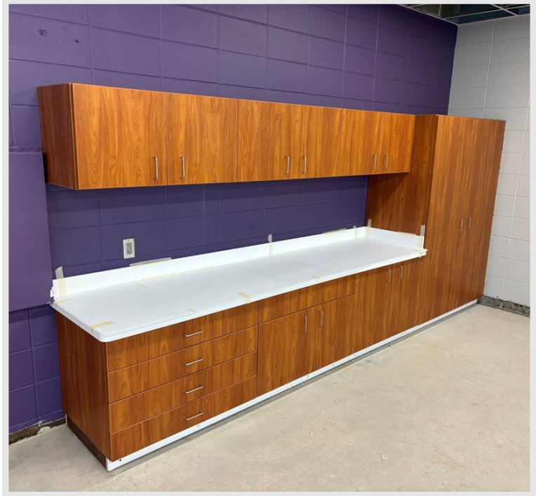
New casework installed!