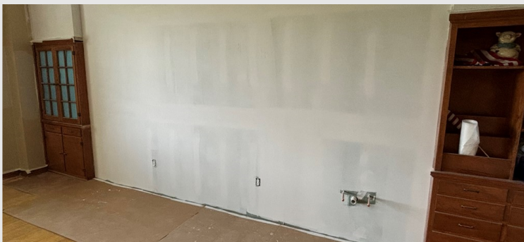
The first layer of primer before paint goes on in the 2 nd Grade Classroom.