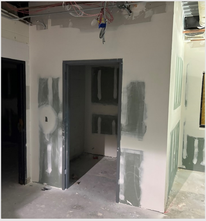
The new toilet room by the office is drywalled and taped. Ready for paint!

//////////////// 206 S. Taft Ave • Jefferson, WI ////////////////// PAGE 4