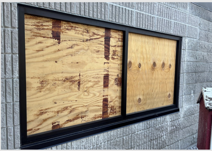
The new window frame has been installed – next step is to add the glass.