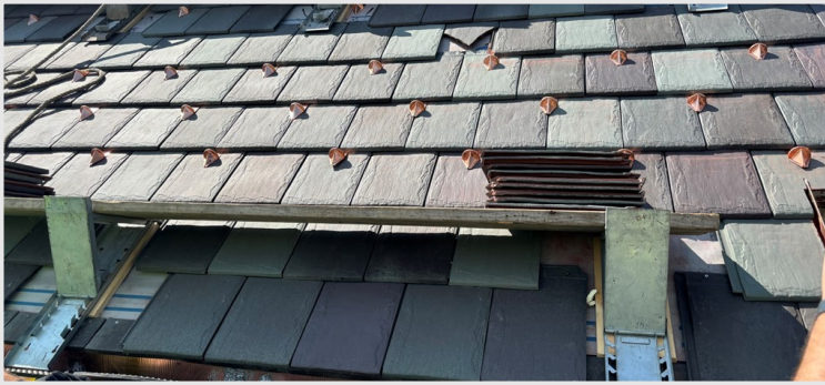
Roofing Crews are installing the new copper gutters and the "LudoSlate" roofing system.

Outside, crews are installing the new copper gutters and the "LudoSlate" roofing system. The old window sashes are being swapped out for a new system. Meanwhile, another crew is finishing up the new overhang at the main entrance. Things are movin' and groovin' on site!